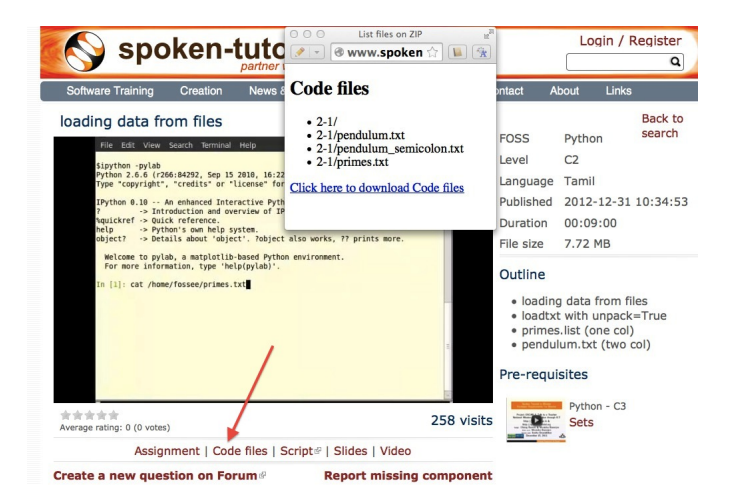
Fig. 2. Resources available for a spoken tutorial explained with an example. The file used in the tutorial is available through the Code files link, indicated by an arrow. On clicking this link, the available code files are displayed in a new window.