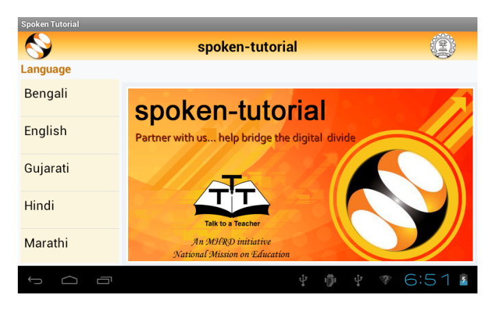
Fig. 7. Spoken Tutorials run on Aakash