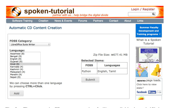
Fig. 3. The automatic CD content creation facility, available through [5], by clicking Software Training > Download Tutorials > Create your own disk image. One can see that English and Tamil versions of Python tutorials are selected, with a size estimate of about 680 MB.

tion, letter writing, report writing, mathematical typesetting and introduction to beamer, in a two hour workshop [6]. Although no domain experts may be available during these workshops, one may get their questions answered through a specifically designed forum [7].