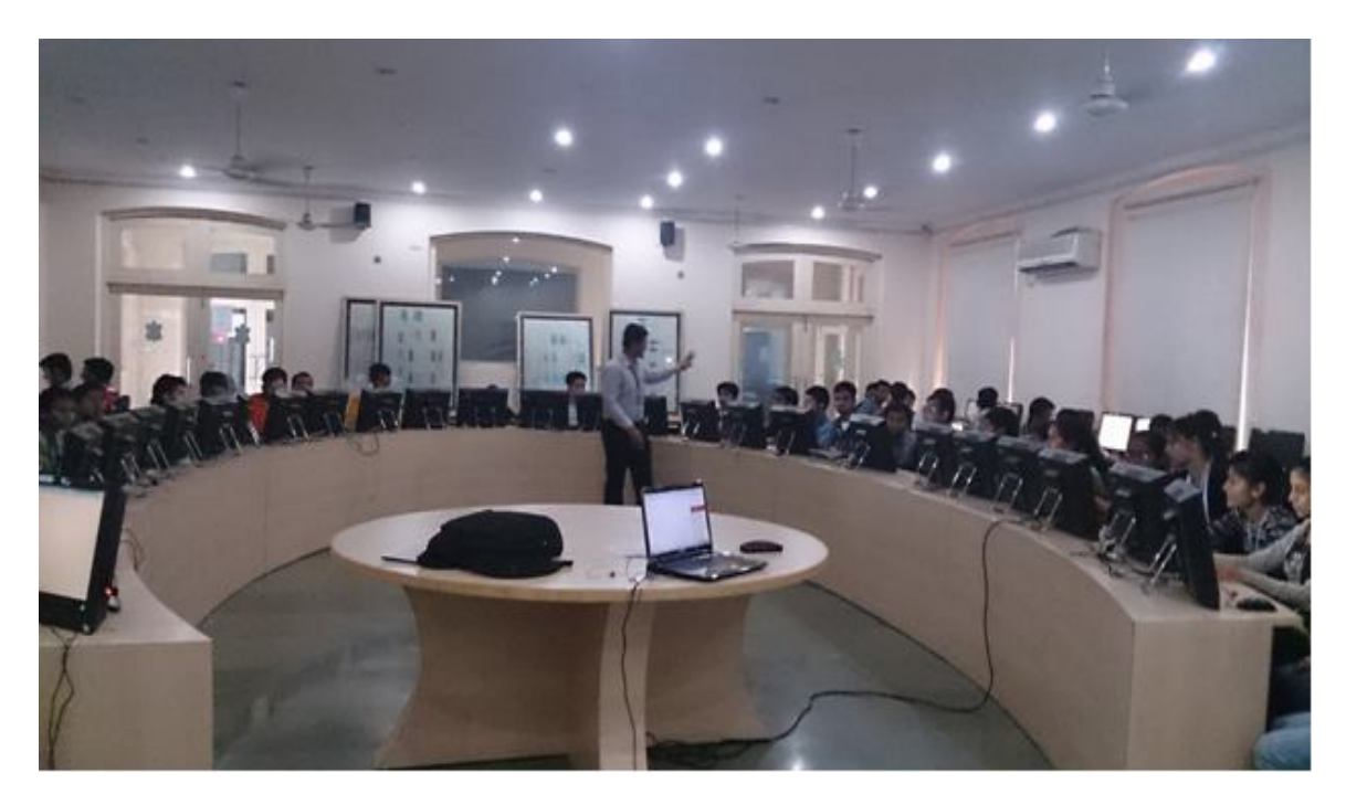
SCILAB WORKSHOP LAB SESSIONS