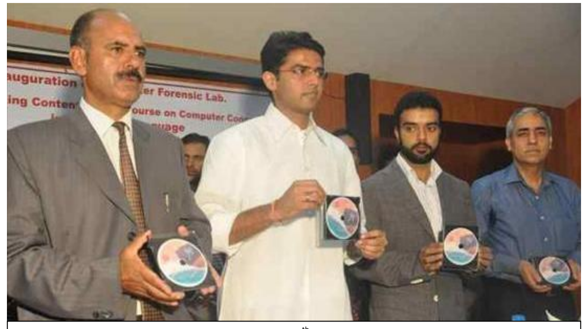
Launch of e-Learning content on CCC in Kashmiri on 20<sup>th</sup> August 2011 by Hon'ble (IT & Comm.) at Srinagar.

The e-Learning content of CCC in Kashmiri was launched by Hon'ble Union Minister of State (IT & Comm.) Sh. Sachin Pilot on 20<sup>th</sup> August 2011 at NIELIT Srinagar.