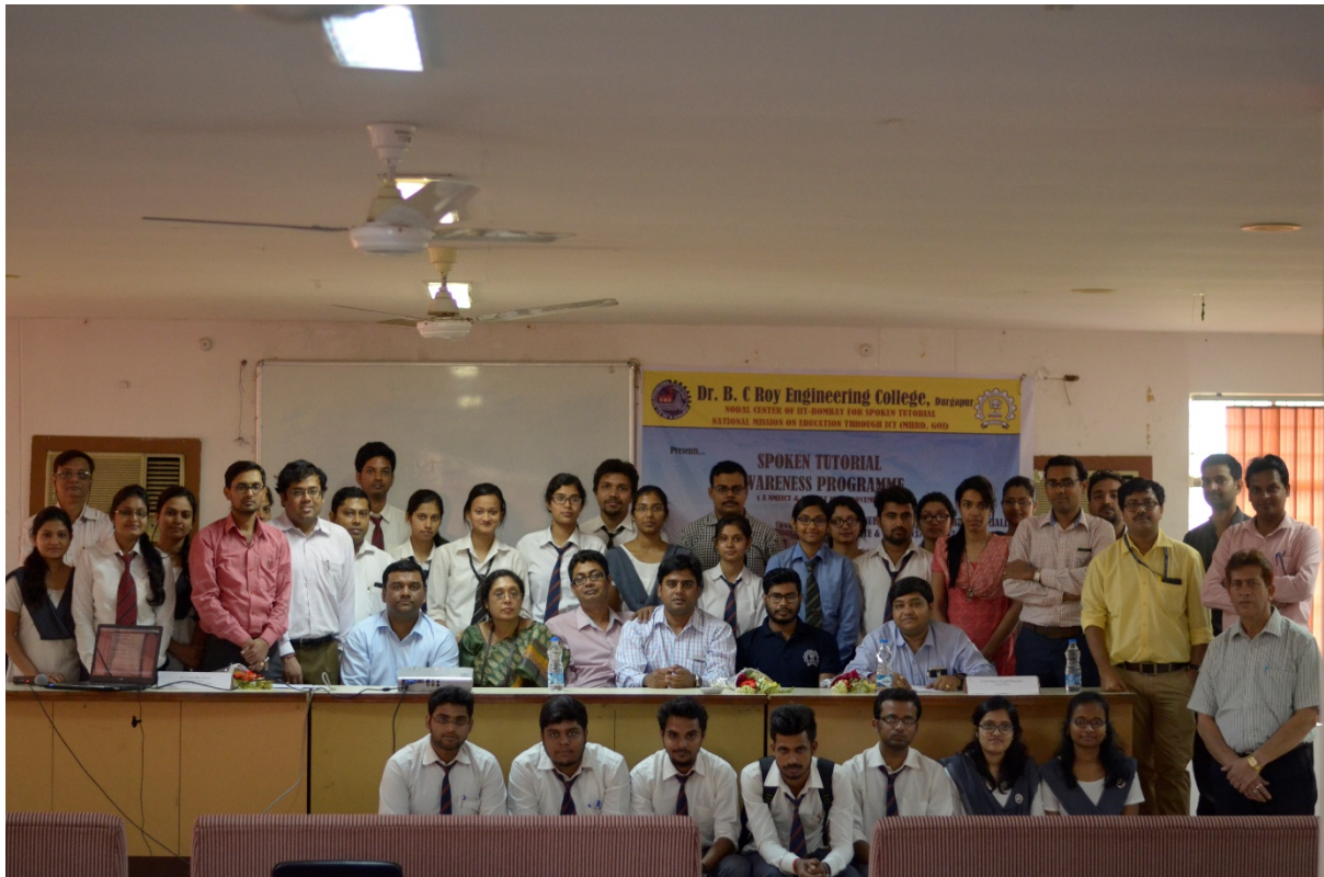
All Student and faculty coordinators and volunteers of Dr. B. C. Roy Engineering College of the Program along with the cluster college member