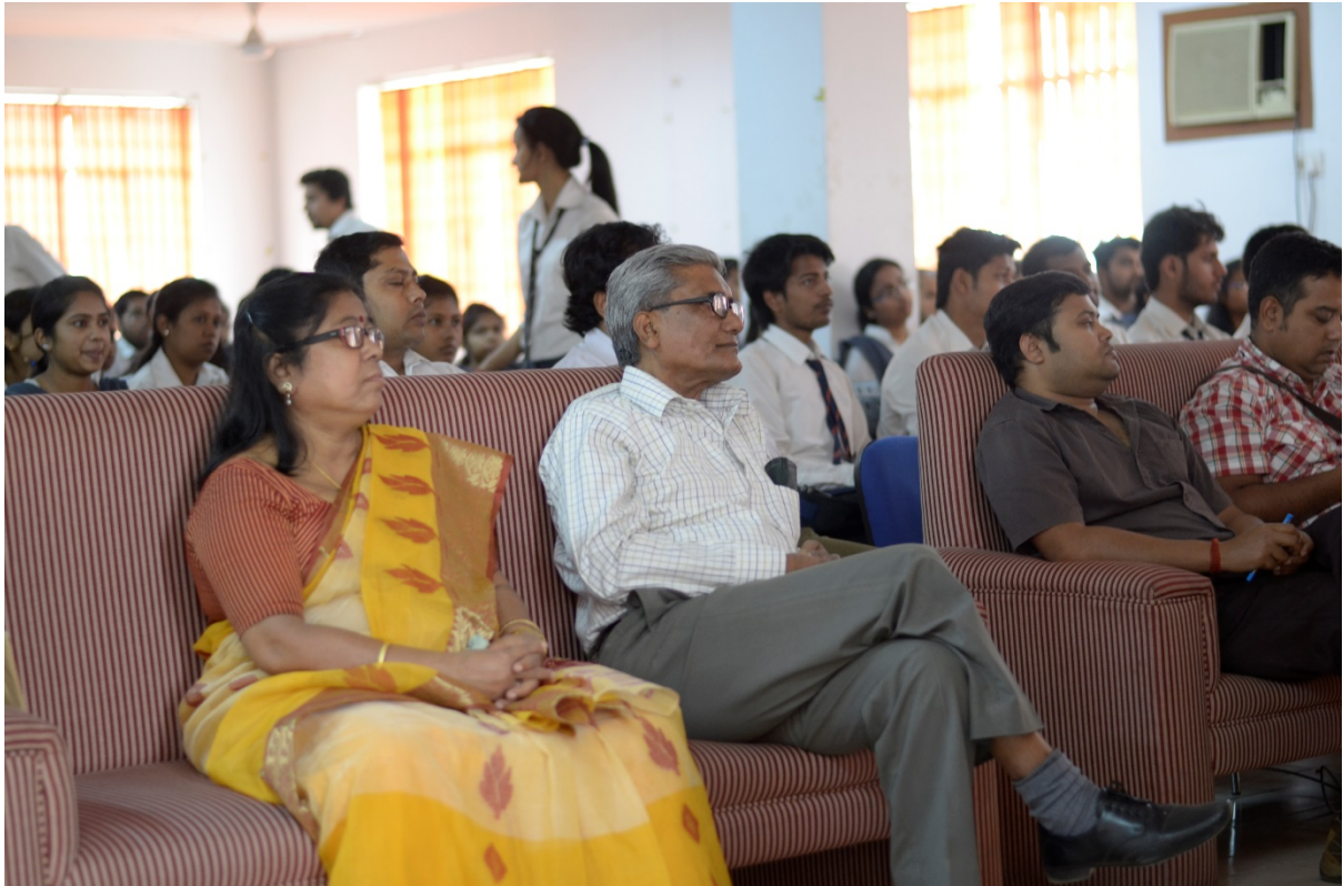
Registrar and Vice Principal