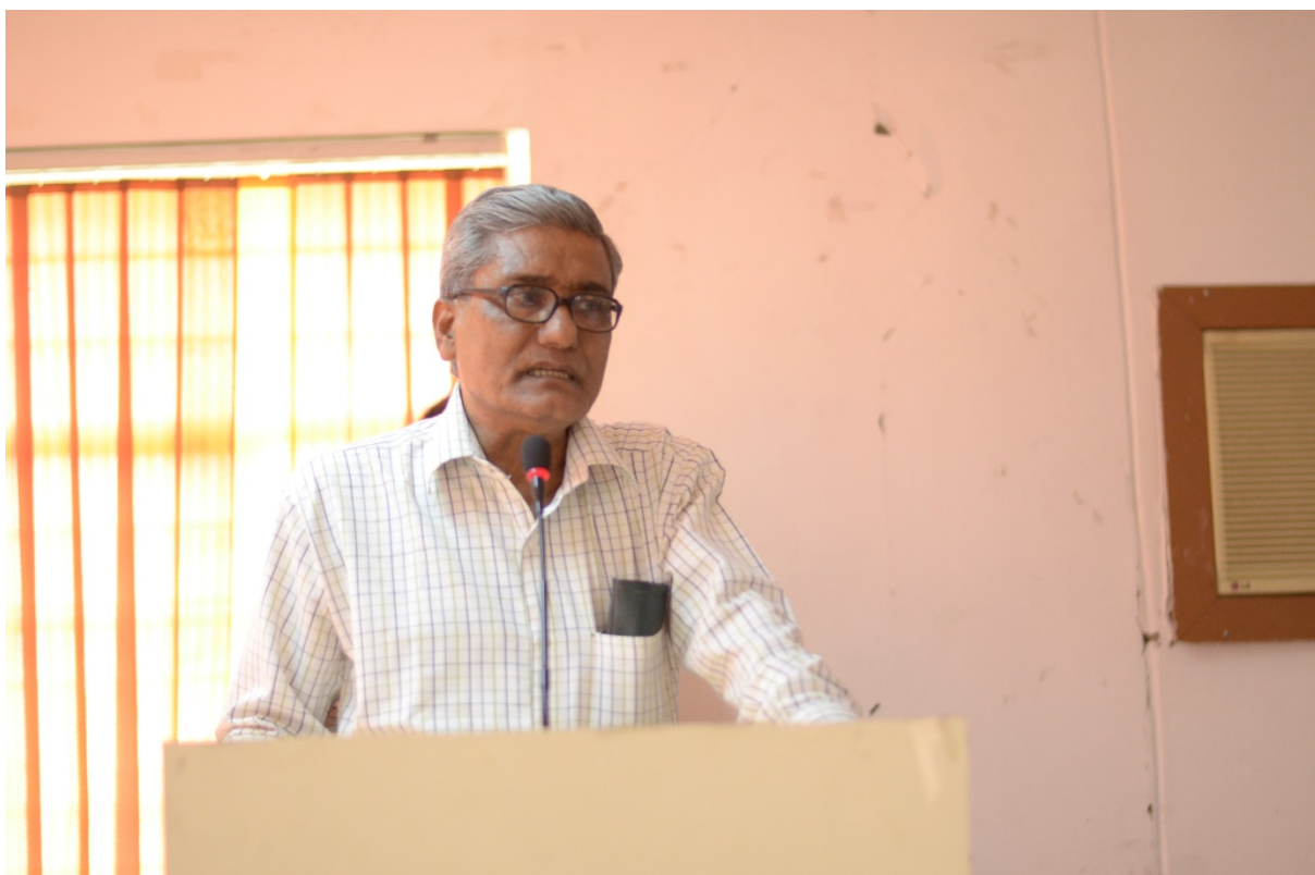
Vice – Principal – Well Come Lecture