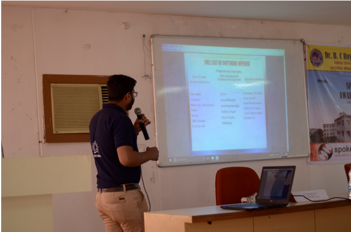
Address to the delegates and the faculty coordinators