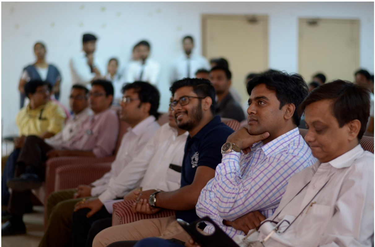
Respetive faculty members and coordinators